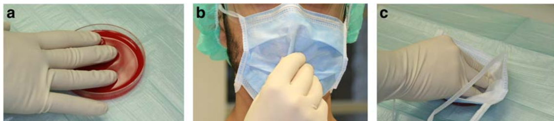
Fig. 1 Microbiological testing of gloves and face mask worn during treatment. a Direct contact sample of gloves worn during treatment, pressing three digits for 5 s on agar plate. b Evaluation of a

Bacterial contamination was detected on all 50 face masks worn during the five treatment modalities. A low bacterial growth with less than 100 CFU (score 1) was found on 46 face masks, more than 100 CFU (score 2) on three masks, and a dense growth with uncountable colonies (score 3) for one