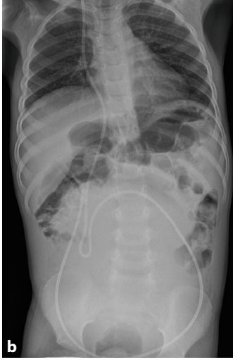
Fig. 1 a X-ray demonstrating cranial displacement of the large intestine, {\bf b} X-ray demonstrating regular intra-abdominal gas pattern