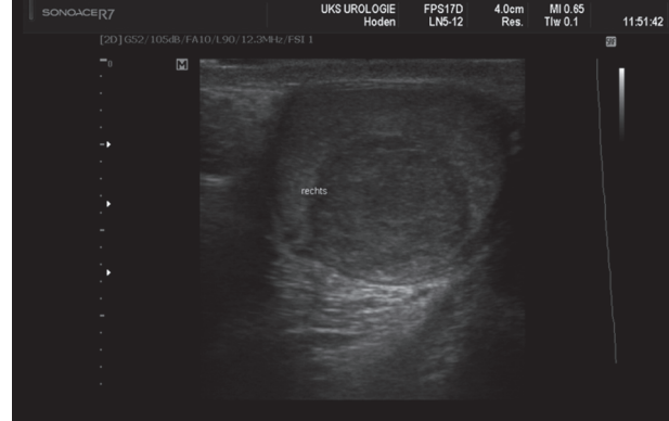
FIGURE 1: Hypoechogenic tumor in the upper pole of the right testis, measuring 1.6x1.6 cm, shown in sagittal (A) and transversal (B) plane.